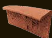
Right hand external angle