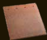
Tile and a half