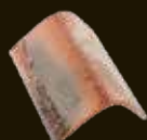
Hog's back ridge