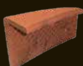
Left hand external angle