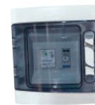
AC protection unit ECU generation monitor Option