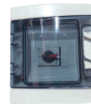
DC protection unit